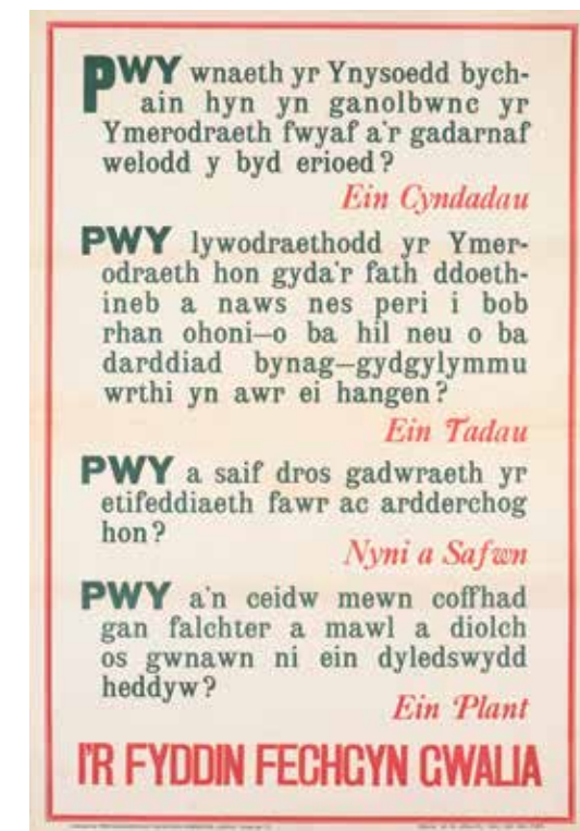
IMAGE: The Parliamentary Recruiting Committee also produced recruitment posters in Welsh.

The Glasgow men saw the centenary as British, rather than Scottish, and therefore less relevant to them. However, finding out that some 200,000 men from Glasgow fought, they were simultaneously astonished and deeply respectful. Women wanted this marked symbolically, ideally by lighting 17,695 candles in the city, one for each Glaswegian soldier that lost his life, and were not put off by the British dimension. “The war was fought as Britain, so that's how it should be marked.” Cardiff participants were against emphasising a ‘Welsh angle’ on the conflict, seeing this as too parochial, and instead argued strongly for a European perspective, particularly German participation at major British centenary events, citing Harry Patch's insistence that German and British veterans carry his coffin. This was their crucial test of whether the centenary promoted reconciliation or jingoism.