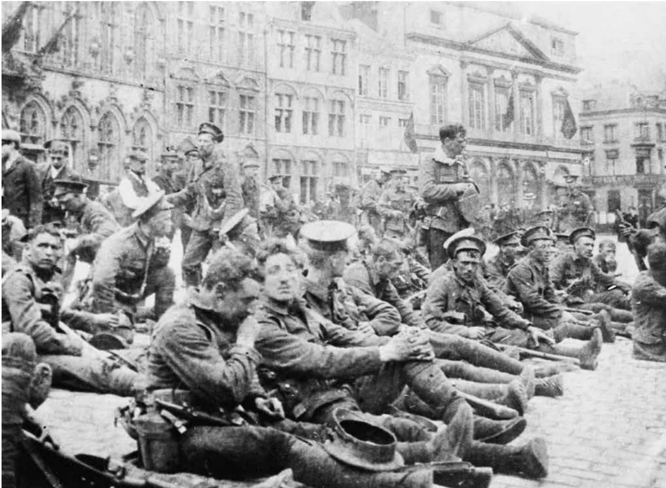
PHOTO: The British Expeditionary Force was concentrated in France by mid-August 1914. As agreed before the war, it moved forward into Belgium on the left of the French Army. Here, men of the 4th Battalion, Royal Fusiliers rest in the Grand Place in Mons on 22 August. The following day the Germans attacked at Mons. Fierce fighting began, and the British started to retreat alongside their French allies. © Imperial War Museums

the complexity and unpleasantness of the past. But it also seems unlikely to build a more cohesive society in the present. Tagging on a celebration of imperial participation onto a set of traditional clichés about military sacrifice may offer a more inclusive version of remembrance, but why should we expect to encompass those alienated by current conflicts or continued discrimination. Shedding some collective tears for the dead might bring a quick emotional hit, but it is hard to see how it will create a more engaged or optimistic citizenry. A more difficult but more productive approach might be to explore, rather than to gloss over, the complexities of the past. Significantly, this is a route that is already being determinedly pursued in Ireland, north and south of the border, where the notion that the war’s history has different, and potentially dangerous, meanings is much more easily grasped than in England, Scotland and Wales. The starting point for such a reflection might be the acceptance that whatever our