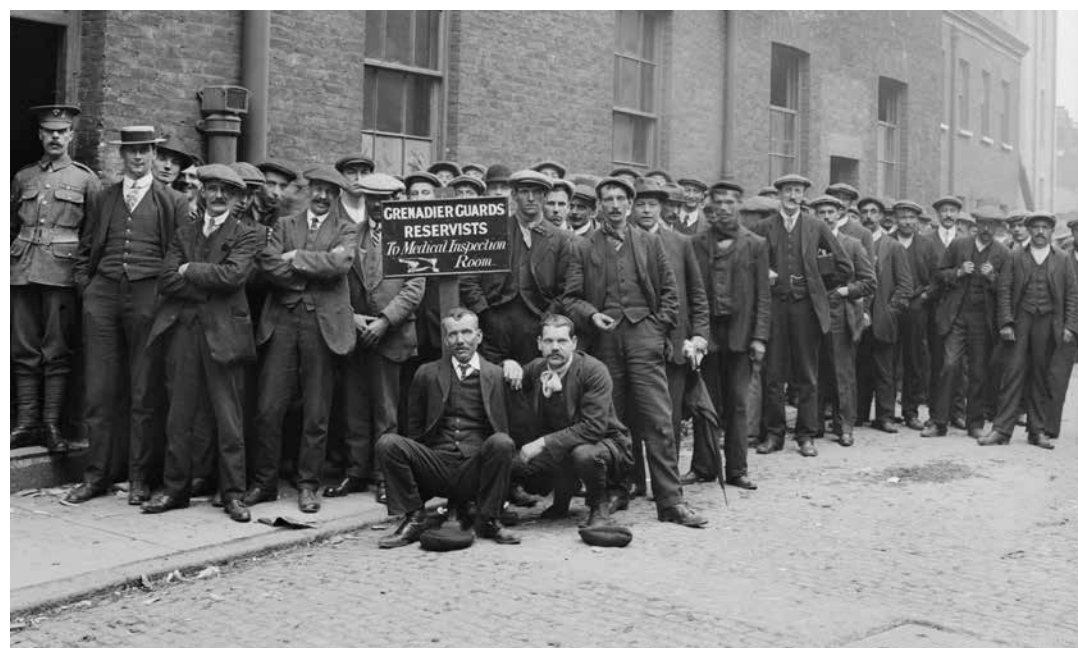
PHOTO: These British reservists of the Grenadier Guards are reporting for duty the day after Britain declared war on Germany on 4 August 1914. Around half of the men who crossed to France with the British Expeditionary Force a week later were retired full-time soldiers who had been called back to serve in the army after the outbreak of war.

The idea of the centenary as “a chance to learn” has a powerful resonance. People are conscious of this war passing from living memory, yet that it remains close enough to be within our grasp to trace the links back. Several who know their family stories of the second world war saw this as a chance to find out whether that was true of the first too. Women particularly talked about the centenary as an opportunity for families. Engaging with children in museums or TV programmes on what they ought to know was a chance to brush up on the history that you wish you had learnt, or remembered, from school.