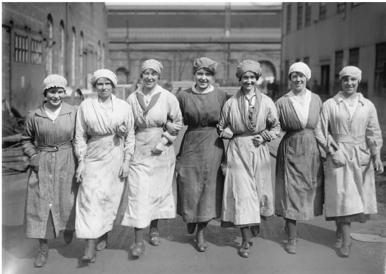
PHOTO: A party of female workers in a Scottish shipbuilding yard.

Yet these assertions are hardly unproblematic. The war involved a massive mobilisation of effort from the British Empire, but telling this as a happy story of hands across the ocean ignores the oppression, opposition and violence that were also entailed, not least in Ireland, where, from 1916, Britons killed Britons during the war in a fight over the future of imperial rule. Here, as elsewhere, the war resulted in a reduction of freedoms and a challenge to liberal values whilst it was being fought, not least because of the emotional furore created by popular involvement in the conflict. That Britons – like almost every other nation in Europe – became if anything more committed to the fight as the casualties got worse tells us a rather darker story about human societies and how hard it might be to secure peace.