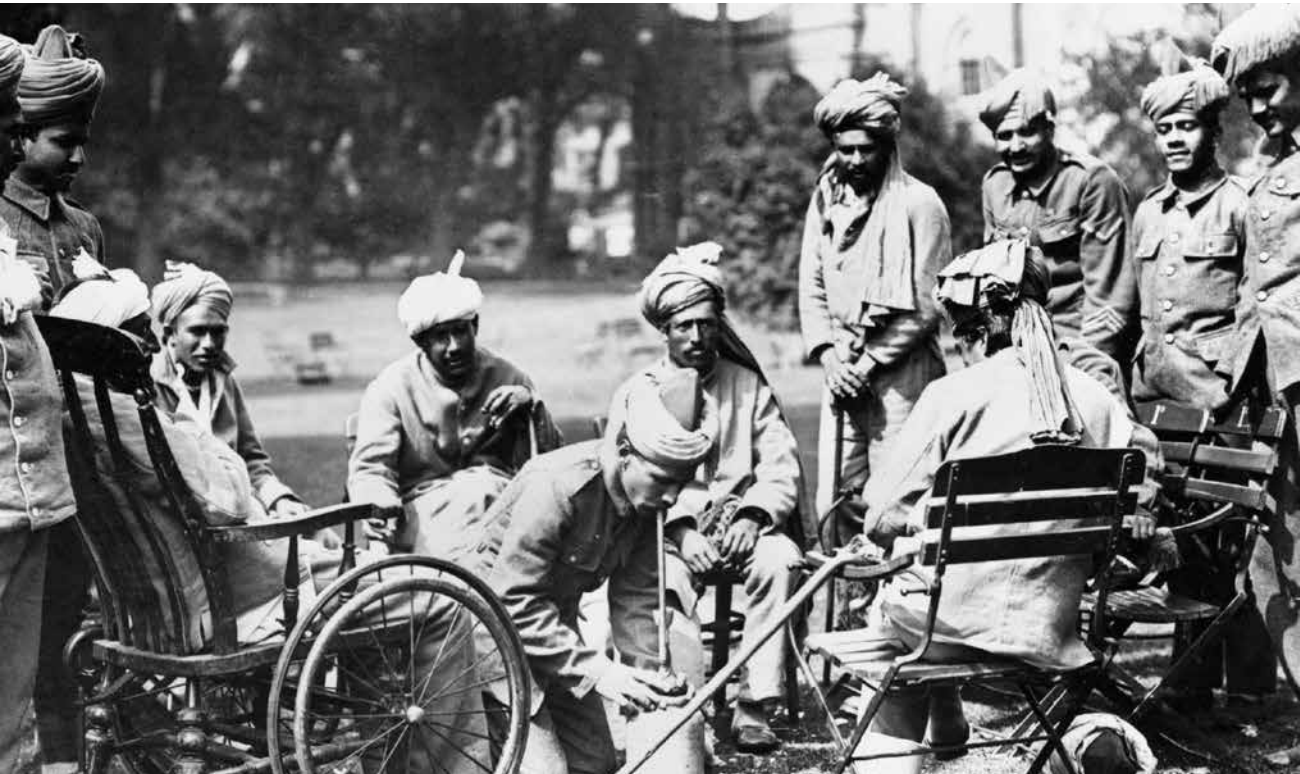
PHOTO: Wounded Indian soldiers using a jam jar as a bookish pipe. Brighton, August 1915.

The fact is, one in ten of the men who contributed to the war effort was from undivided India; this was a truly global conflict. Indeed, Britain’s diversity grew from history reflected in Commonwealth and multi-ethnic contribution to both world wars. And, as British Future’s research shows, the majority of people – 80% – agree with this fact today.