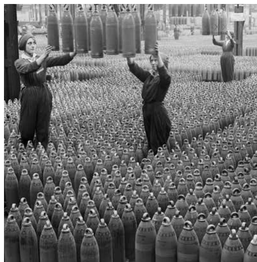
PHOTO: These women, manufacturing 6-inch (152mm) howitzer shells at the National Shell Filling Factory at Chilwell in Nottinghamshire, were part of a huge wartime increase in female workers employed in the munitions industry. By April 1918, 90% of shells were being made by women and the number of women workers in British industry as a whole was approaching three million.

As war got underway, though, it became clear that extra workers were required to supply munitions, uniforms and boots for those at the front. Women were more conspicuous on the factory floor, on farms and in offices and, as conscription was introduced, their numbers increased further. Their wages, however, did not, and while there was legislation for equal pay in certain munitions roles, the reality was somewhat different. Some women factory workers even had to hand over a proportion of their earnings to male machine-setters.