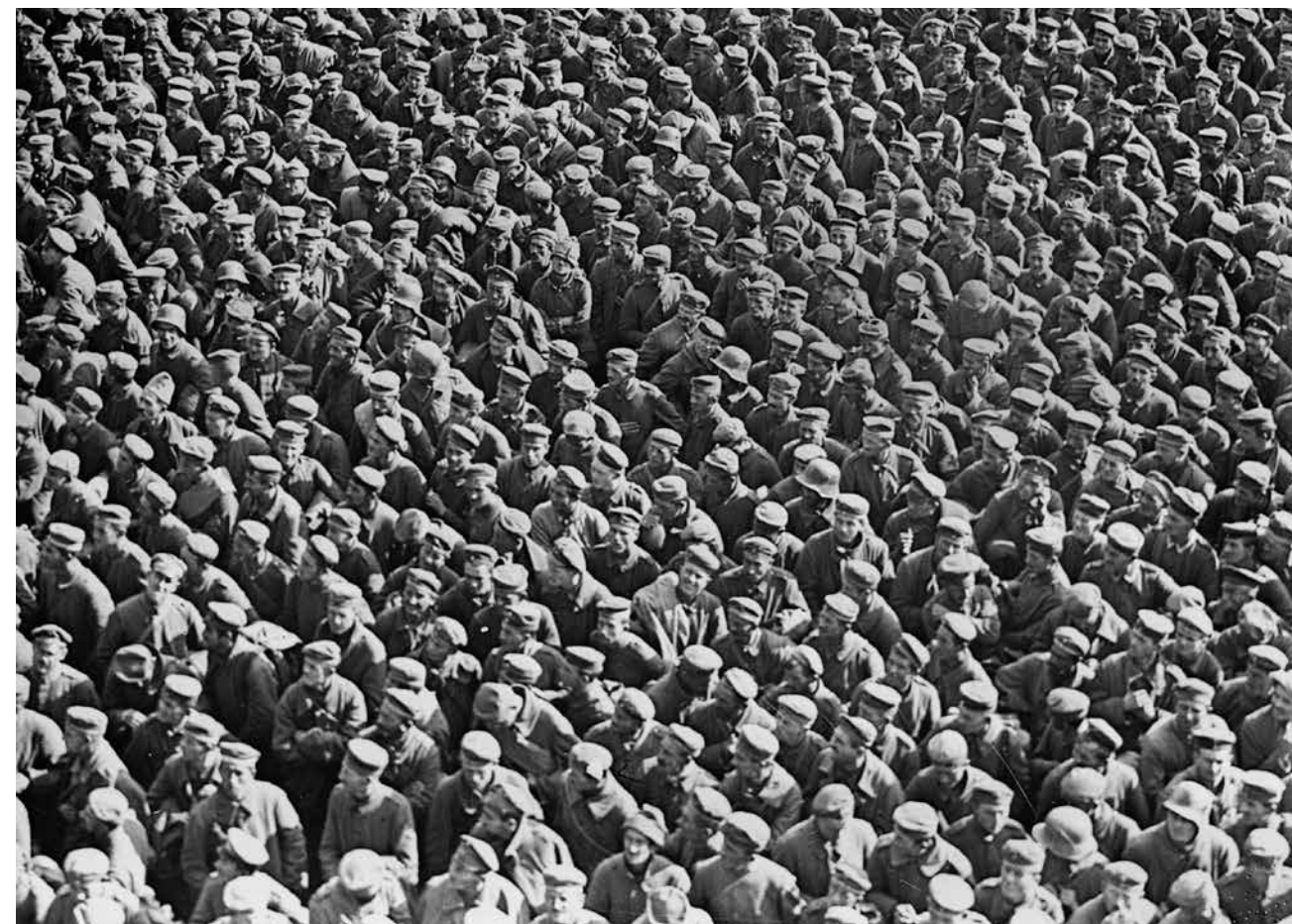
PHOTO: After weeks of attack and withdrawal, towards the end of July 1918 the Allied armies under the overall command of French General Ferdinand Foch, began to hit back. A rolling series of battles began which steadily pushed the Germans into retreat. As they fell back, thousands of German soldiers were taken prisoner and held at depots like this one at Abbeville in France.

Casting commemoration as a parade of facts to demonstrate the national values we’d like to have now would grossly misrepresent